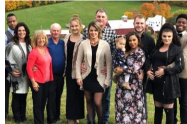
Sargents small group